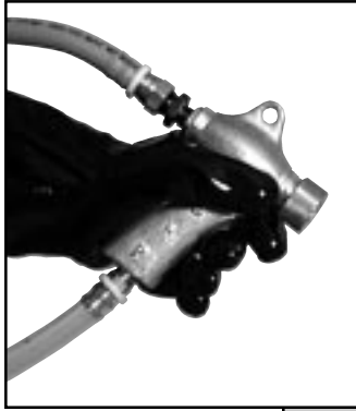
Fits the hand easily

High-production, hand-held blast cleaning gun for use in any suction blast cabinet. May be mounted in fixed position. Made from cast/machined aluminum. Gun assembly includes gun body, orifice with locknut, O-ring and nozzle holding nut. Order nozzle separately.